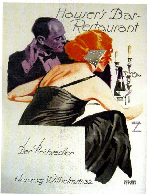
Hauser's Bar-Restaurant. By Hohlwein (1921). Dimensions: 34-1/2" x 48". (No. C152). Price: $6,000.

Ludwig Hohlwein. Most famous German poster artist of the 20th century. Captured the lifestyle of Europe's rich and famous during the Teens, Twenties, and Thirties. Found today in museums worldwide—and still a powerful influence of graphic artists.